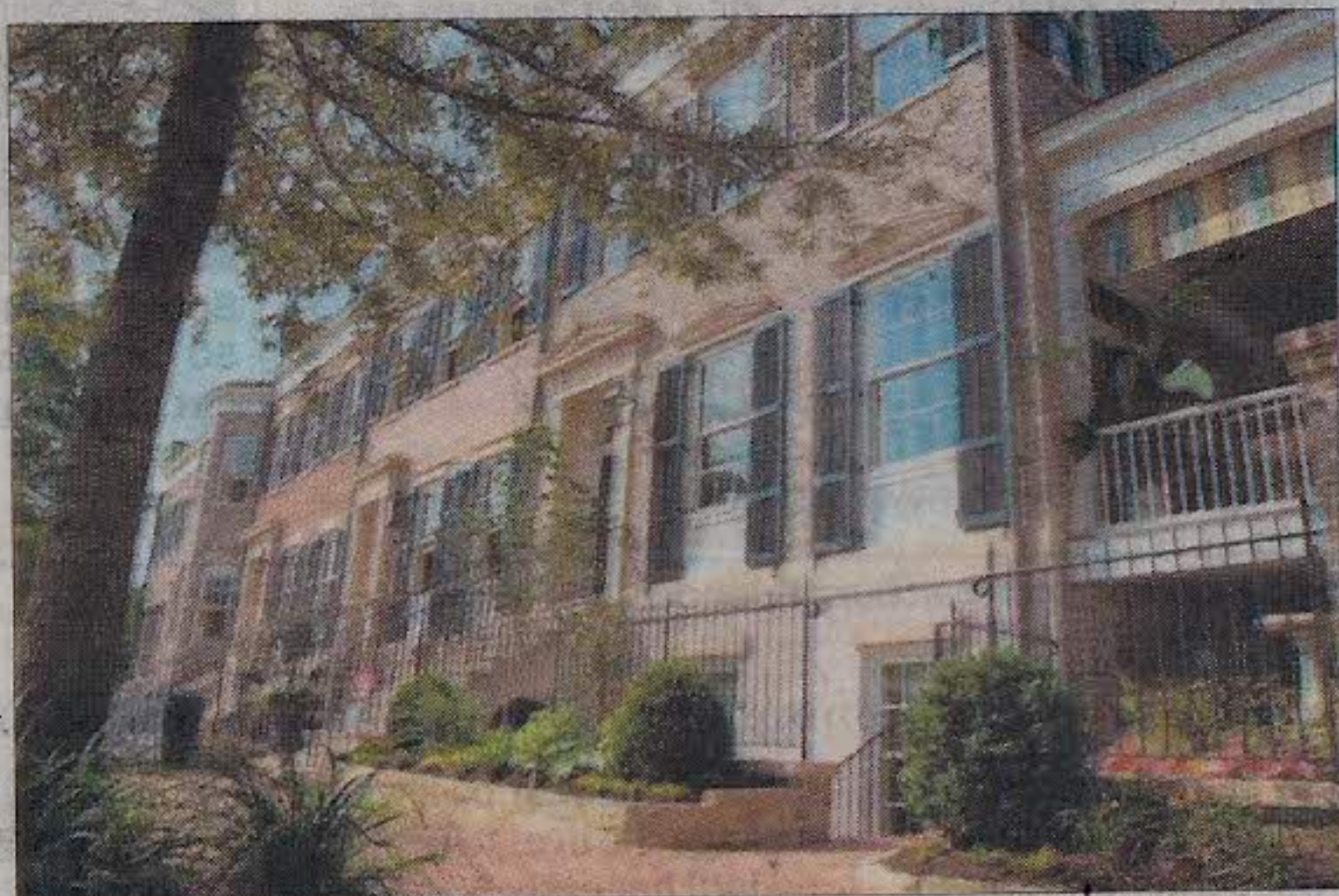
The brownstone is within an 11-acre residential and mixed-use development off Main Street that will be used as a background for movies.