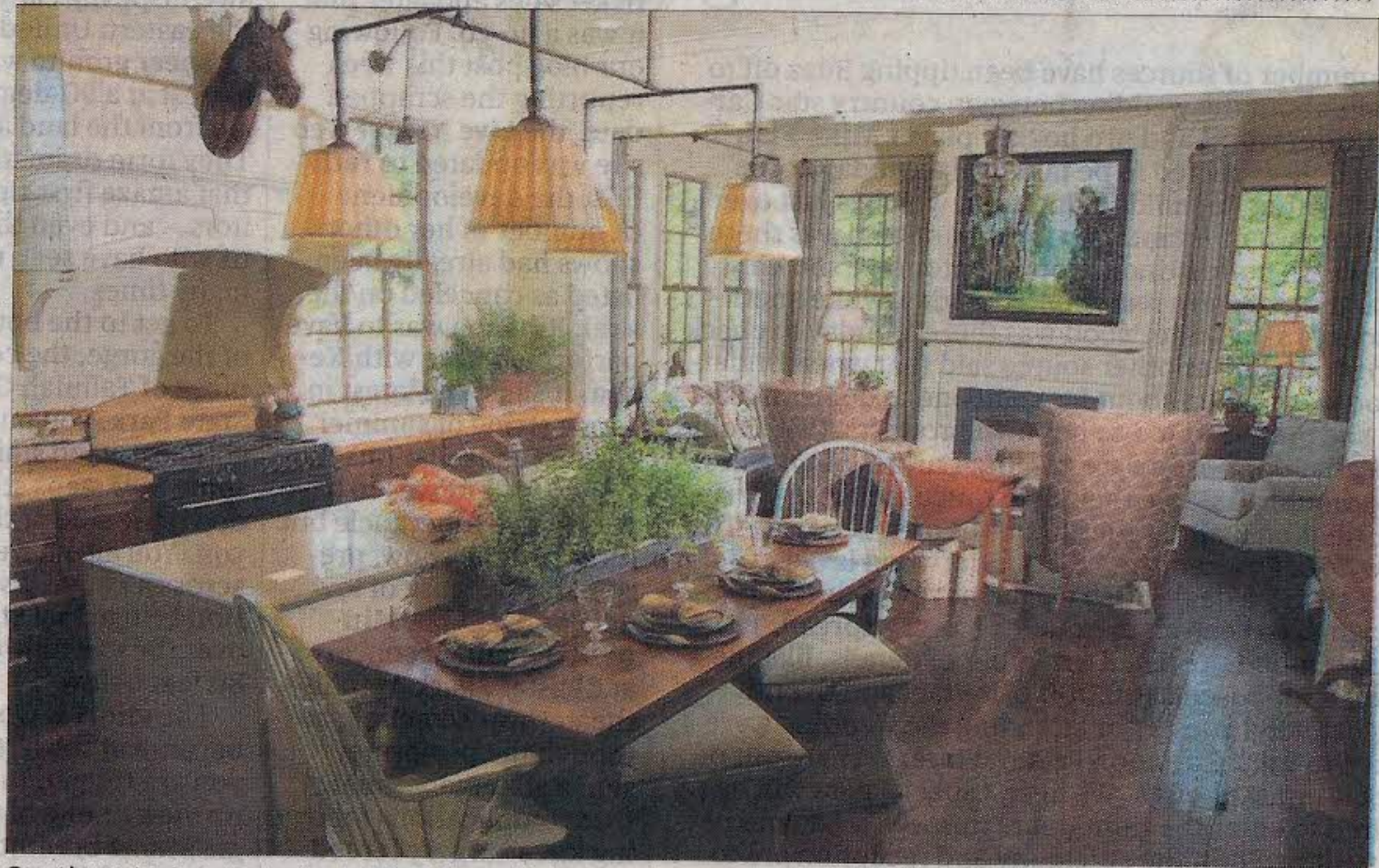
Southern Living magazine's Idea House in Senoia features an open, relaxed atmosphere in the kitchen and hearth room. The home is in a corner unit in a row of brownstones, near the intersection of Gin and Broad streets.